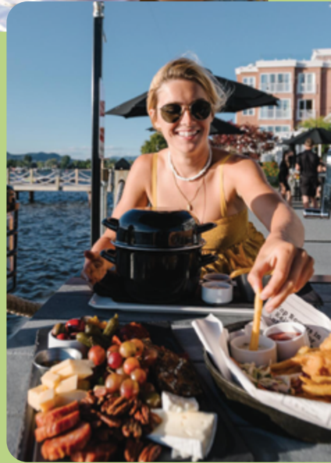
DINING ON THE BOARDWALK AT HOTEL ELDORADO.

Situated on the shores of Okanagan Lake, the iconic Hotel Eldorado has been a beacon of lakeside elegance since 1926. Founded by Countess Bubna, an English stage actress-turned-aristocrat with a flair for glamour and adventure, the hotel began as a refined retreat for her worldly circle—drawn by the valley's natural beauty and the promise of a new railway connection in 1927. Today, the hotel blends classic charm with modern indulgence. Guests enjoy access to a private marina, lakefront boardwalk, heated outdoor pool and hot tubs, and over 50 stylishly appointed rooms and suites. Rooted in history, yet always looking forward, Hotel Eldorado is a story still unfolding, with each visit adding a new page to a century-old story.