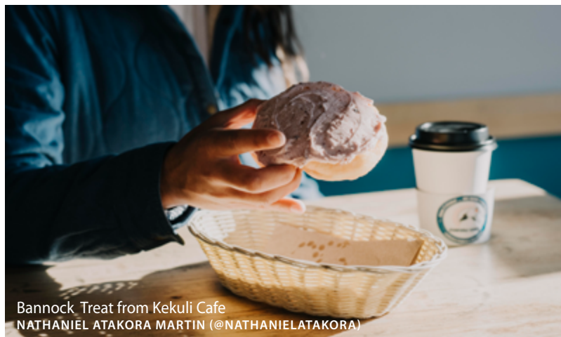
Bannock Treat from Kekuli Cafe

In summer, food naturally spills outdoors, and not just onto patios. Ribfest fills City Park each July with food, music, and long communal tables under open sky, while Diner en Blanc appears once a year in a temporary location, transforming a public space into a shared open-air dinner.