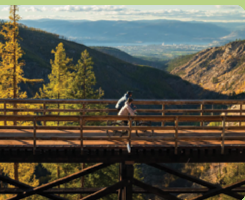
BIKING AT MYRA CANYON TRESTLES DURING GOLDEN LARCH SEASON.

Prefer less sweat and more sip? Lakeside Eco-Sports in Kelowna invites visitors to zip through the Okanagan Valley on a self-guided e-bike tour. The route includes wine and mead tastings at three venues, along with a vineyard-side charcuterie lunch at Meadow Vista. Hoodoo Adventures combines paddles with pours on its award-winning Kayak Wine Tour. Embarking from Penticton, guests paddle sunny Okanagan Lake before