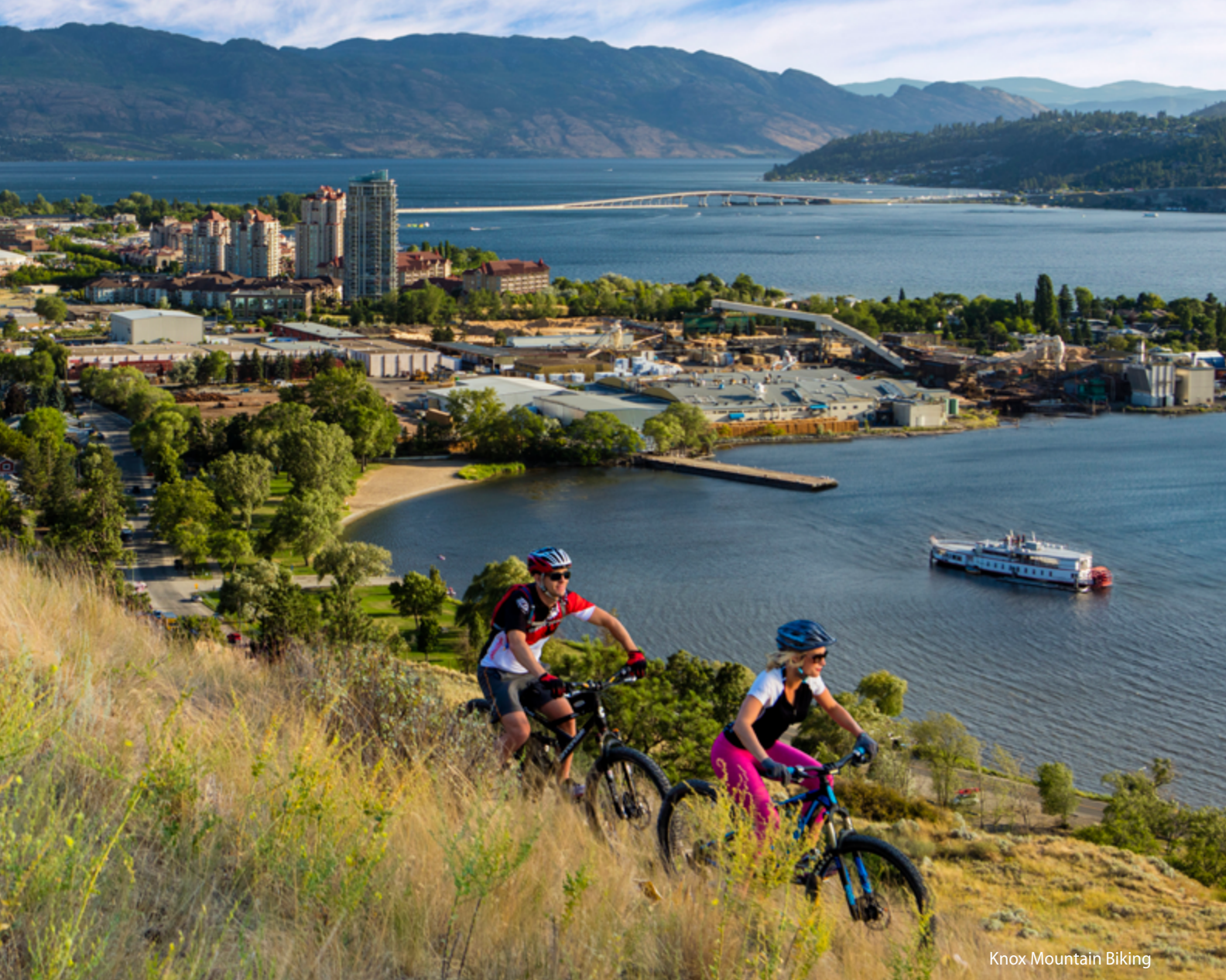
Knox Mountain Biking

K elowna's built quite the reputation as a summer bucket-list destination, thanks to its lush vineyards, long, lazy lake days, and slower pace of life. It's the version everyone knows, but it only scratches the surface of the valley.