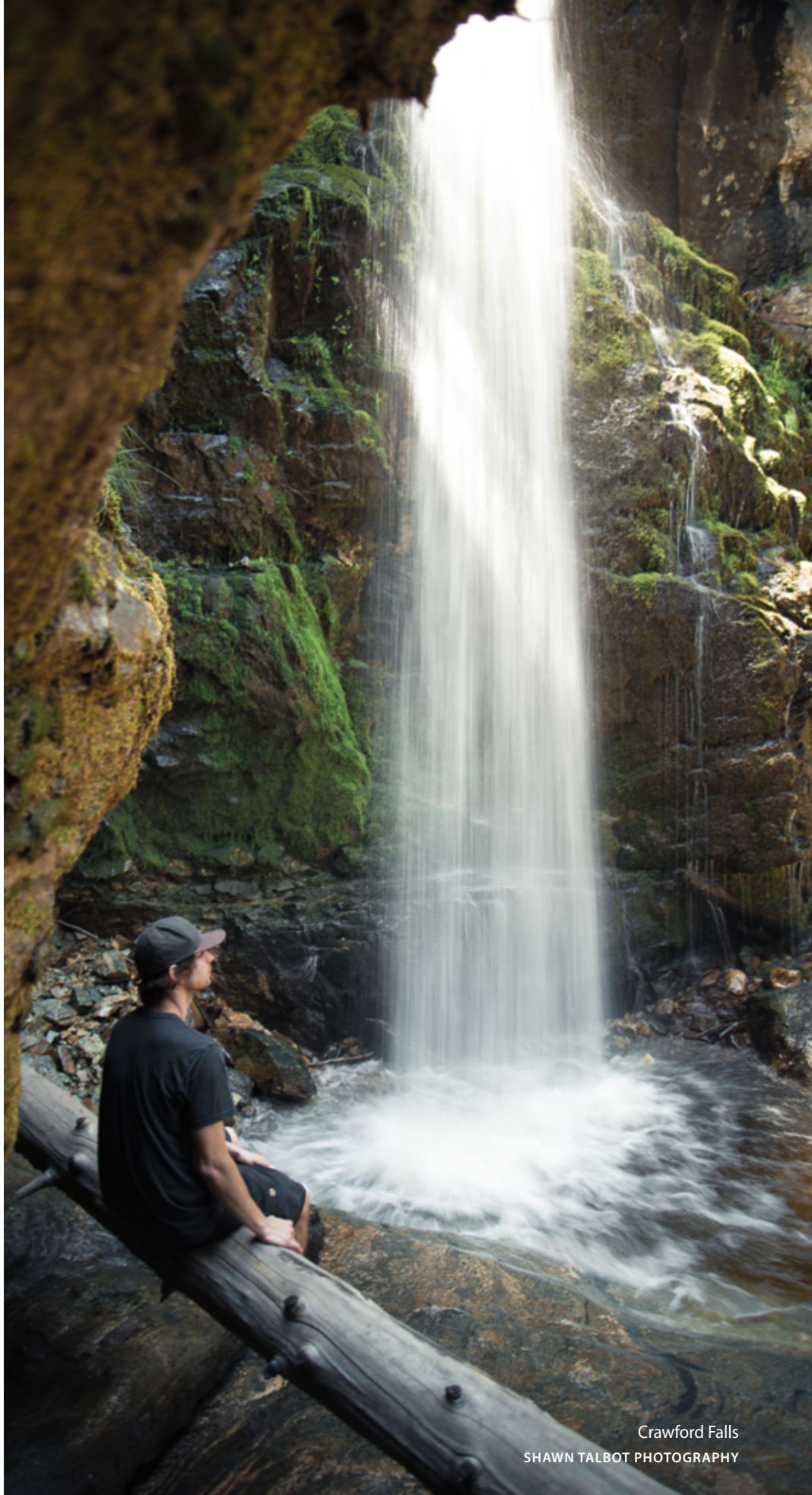
Crawford Falls

At the larger end of the scale, summer music in Kelowna can be heard in vineyard amphitheatres and at downtown festivals. The Mission Hill Concert Series brings major Canadian artists each summer, with names like Tom Cochrane (July 8) and Burton Cummings (July 22) performing against vineyard views, while the Touchdown Kelowna Festival runs from June 26 to July 4, filling the downtown core with concerts, community events, and football throughout the week. The annual standout is Music in the Park, a free Friday series at Memorial Park during July and August, where people settle onto the grass with their farmer's market finds and simply enjoy the music under the clear Okanagan night sky.