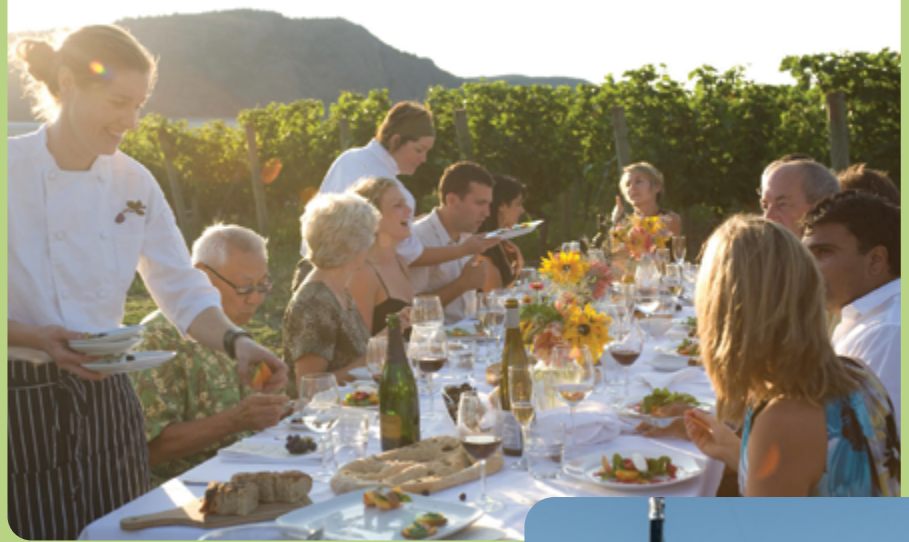
DINING IN THE VINEYARD AT BLUE MOUNTAIN VINEYARD AND CELLARS NEAR OKANAGAN FALLS.

Located in the heart of Valleys and Vineyards, Kelowna is crafting a new chapter in culinary history as Canada's first UNESCO Creative City of Gastronomy. More than merely a title, the designation recognizes cities with cultures rooted in food: from sustainable farming and Indigenous culinary traditions to communities that live and breathe local. Kelowna is known for its sun-drenched vineyards, abundant orchards, and innovative hyper-local food scene. This designation serves as the ultimate pairing of place and plate.