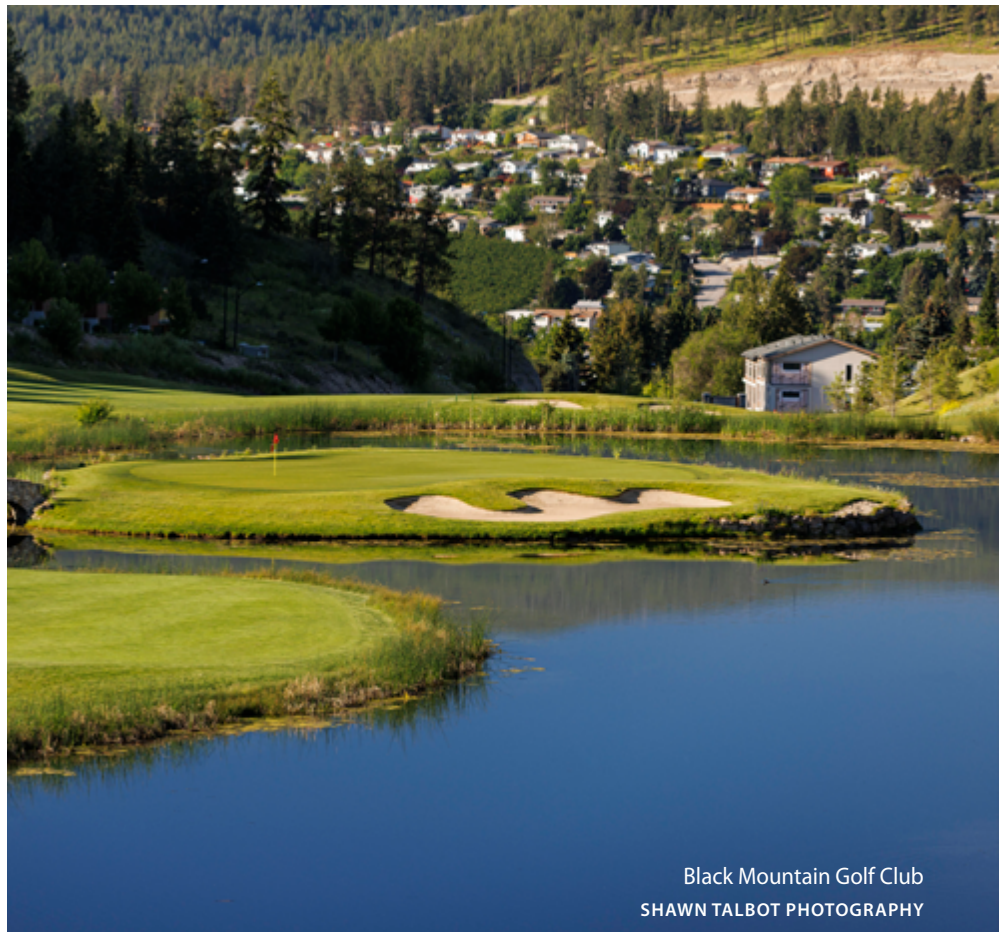
Black Mountain Golf Club

This snack shack culture embodies something very distinct about Kelowna these days. On the surface, it appears one way, but spend a little more time here and you start to see just how much is going on. 🍷