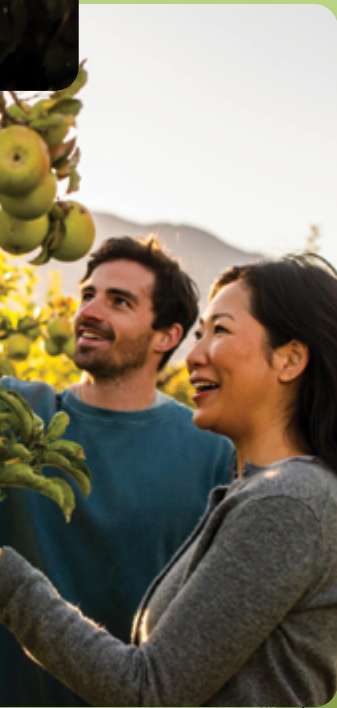
PICKING APPLES AT KLIPPERS ORGANICS IN CAWSTON.