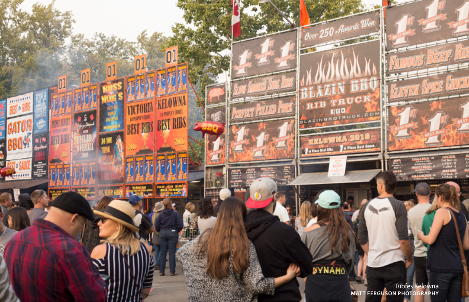
Ribfes Kelowna