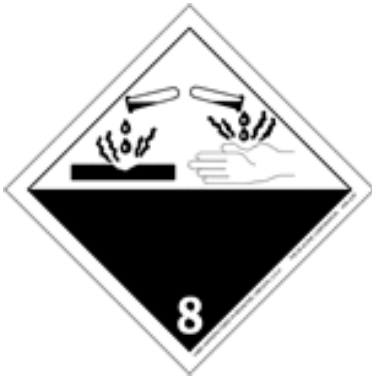
Class 8 Corrosive