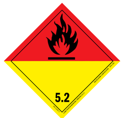
Class 5 Oxidizer and Organic Peroxide