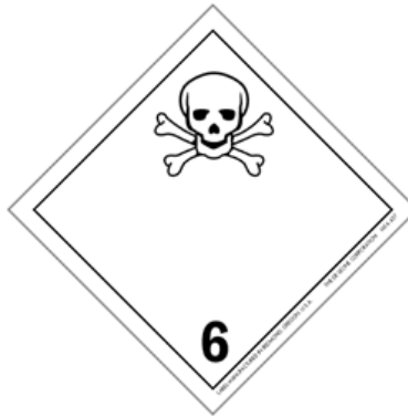
Class 6 Toxic and Infectious Substances