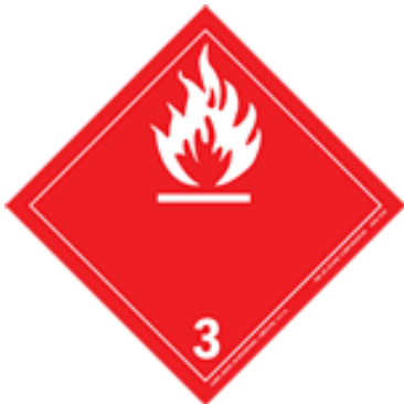
Class 3 Flammable Liquids