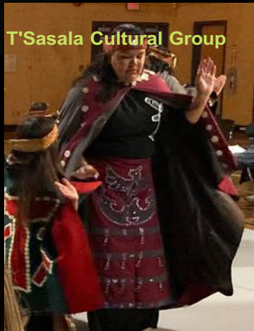
T'Sasala Cultural Group